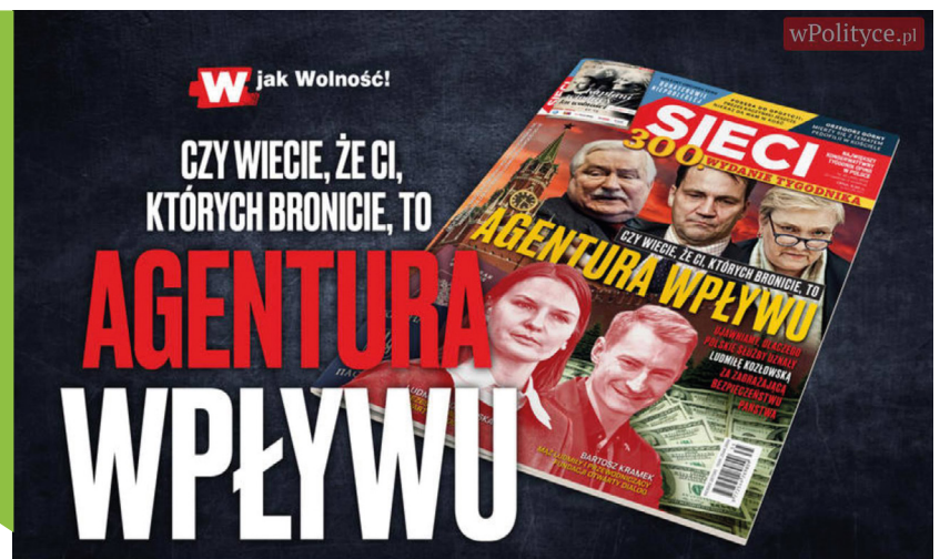
Cover of Polish pro-government weekly "Sieci" No 300, showing Lyudmyla Kozlovskaya and Bartosz Kramek with Lech Wałęsa, Radosław Sikorski and Róża Thun, captioned "Do you know that the ones you're defending are foreign agents?", 08/2018